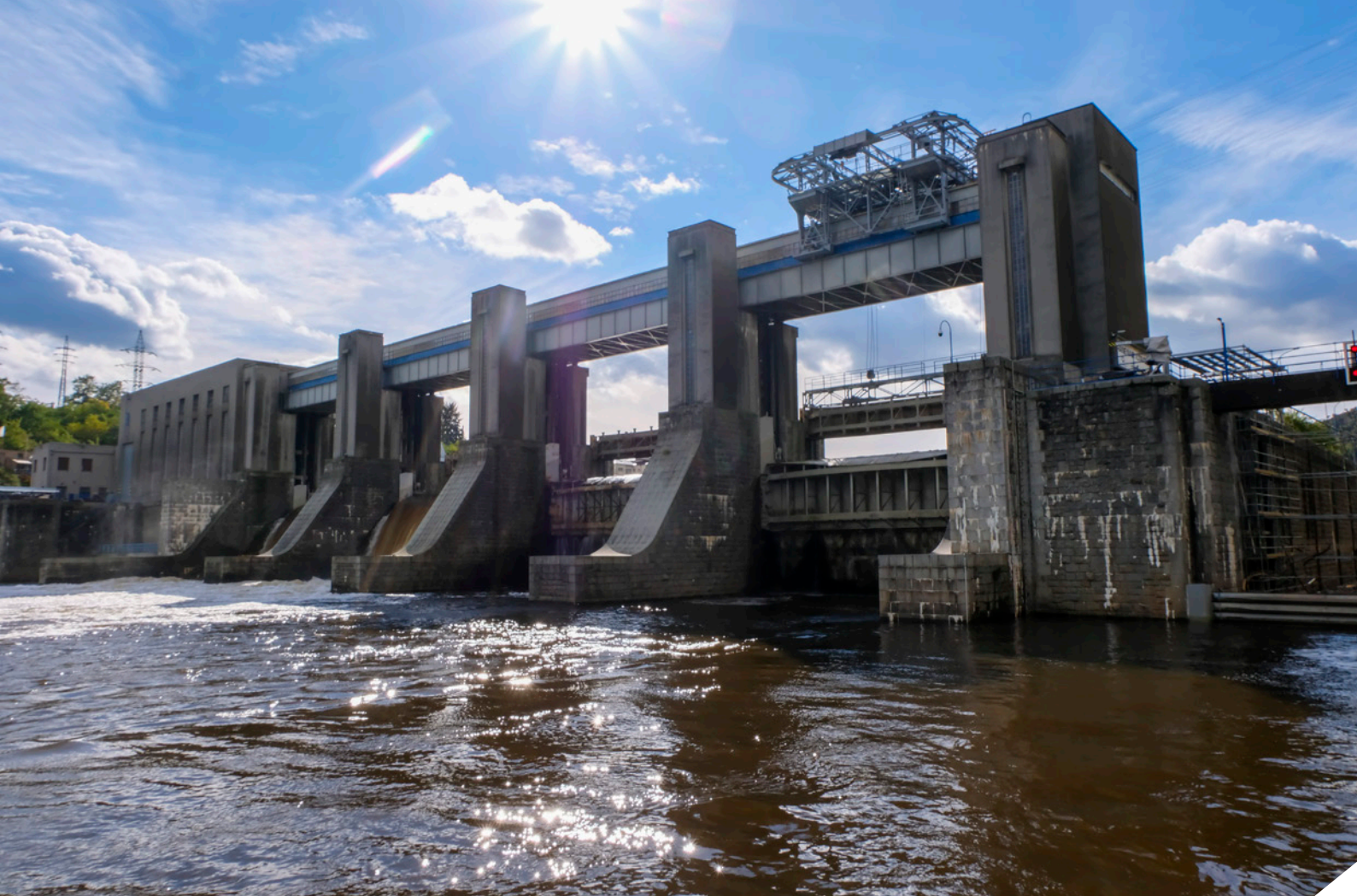
Štěchovice lock and hydroelectric power station