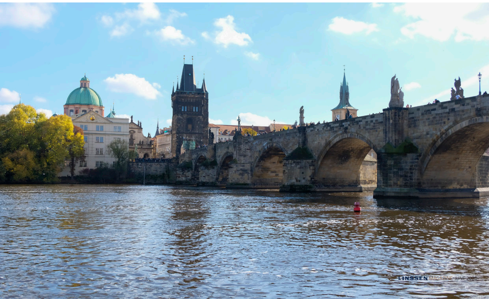
Karlsbrücke in the centre of Prague