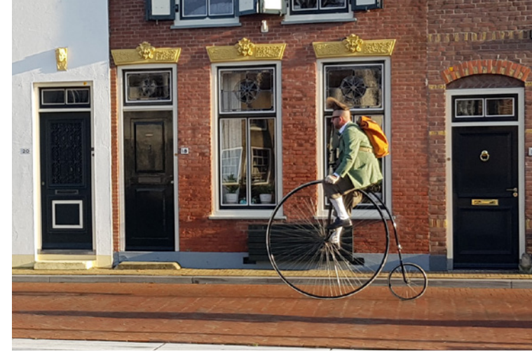
Time has literally stood still in Middlesharnis...

The ocean giants gradually appeared on the horizon, looking very small at first. They had reached the North Sea. At a safe distance from these large, fast, seagoing vessels and under a blue sky and radiant sunshine, they arrived in Breskens. They weren't going to miss out on a freshly caught lobster here, prepared by fishmonger Cor. "Cor's fishing boat is a real attraction!"