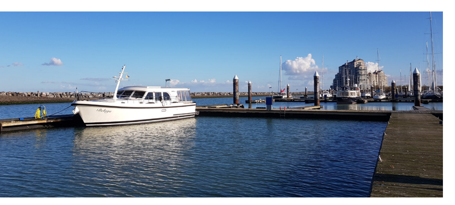
Arrival in Breskens under a bright blue sky.

Arriving in Kinderdijk, we cycle to the windmill park that is even on the Unesco World Heritage list. There is an impressive collection of windmills in a beautiful natural park.