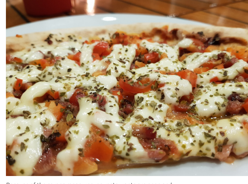
Because of the corona measures, no restaurants are open and Sanne cooks every evening on board. The Beluga is so well equipped that anything is possible. Today fresh pizza.

After spotting seals during a glowing red sunrise,