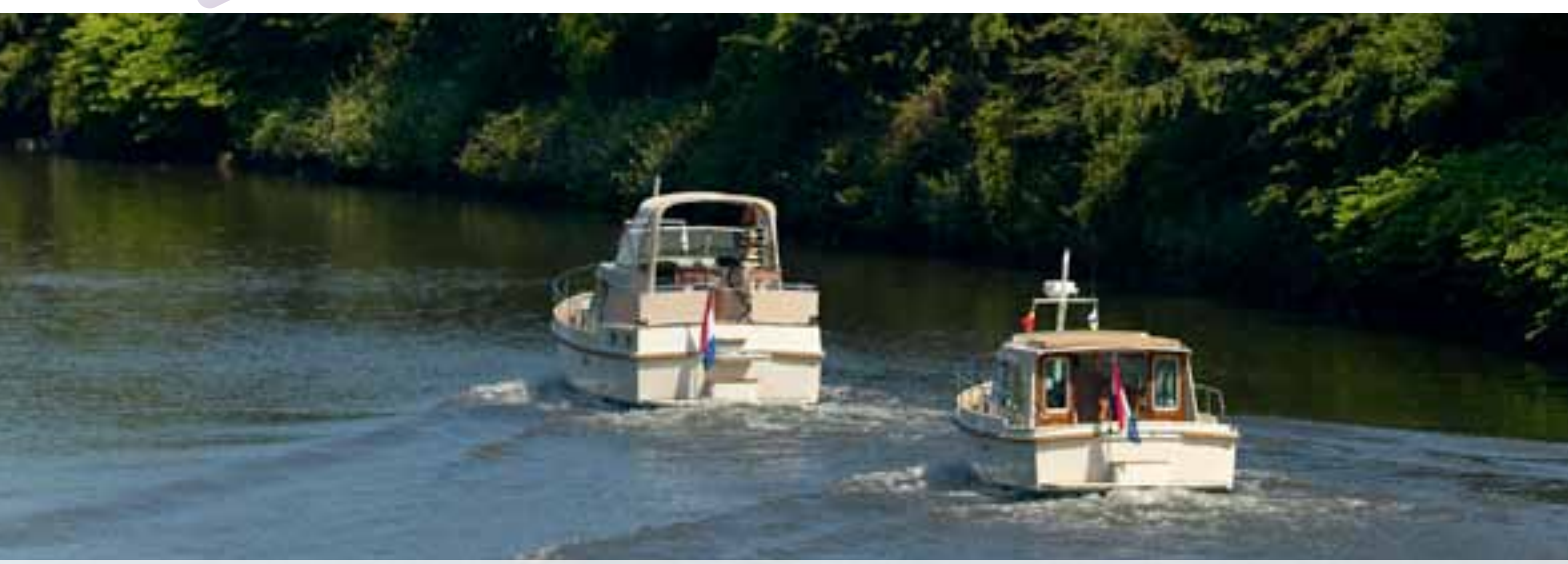
Go to <u>www.dewillemsroute.eu</u> for requests and to download the brochure containing interesting information about the towns en route.

The app also offers you a digital guide to ten touristic high points along the route. By sharing a travel experience at such a high point you can earn a digital stamp. At the end of the 2011 sailing season, we will raffle a prize among all participants.