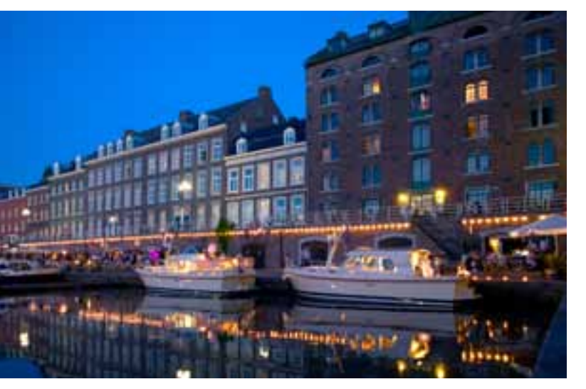
"...the Bassin marina in the heart of the old centre of Maastricht..."

The Willems Route is an attractive alternative for sailing from Roermond or 's-Hertogenbosch to Maastricht and vice versa. This splendid route is mainly intended for boaters who want more than to simply sail from A to B. An easily passable and pleasant waterway that flows along many attractive places in